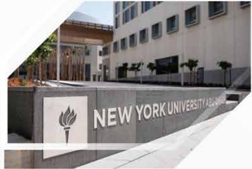
New York University Abu Dhabi