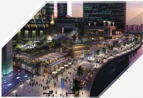
The Galleria Mall Abu Dhabi