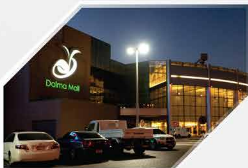
Dalma Mall Abu Dhabi