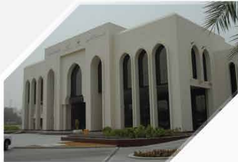
Al Ain Municipality Abu Dhabi

Our staff has participated in a variety of projects that have serviced an array of different infrastructures. The following examples represent a small list of some of those projects in the Middle East.