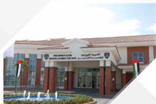
Sheikh Zayed Private Academy Abu Dhabi