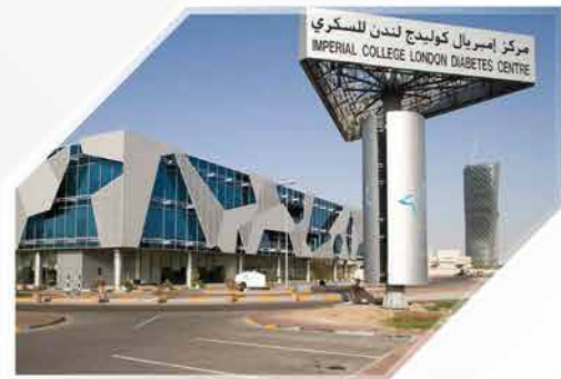
Imperial College London Diabetes Centre Abu Dhabi